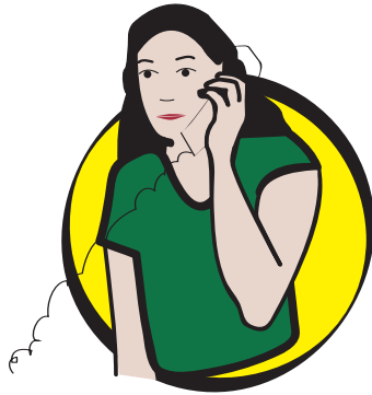
On the phone

So she called for the doctor to be quick, quick, quick