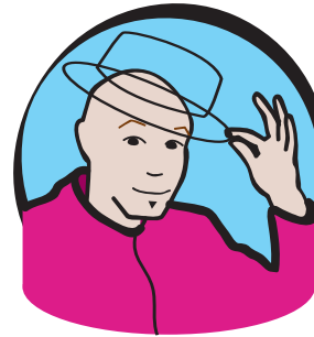
Indicate a hat

The doctor came with his hat and his bag