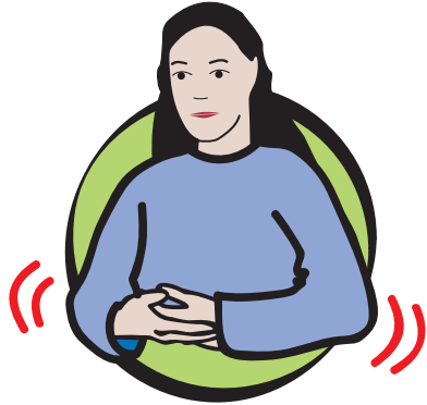
Rock arms side to side

Miss Polly had a dolly who was sick, sick, sick,