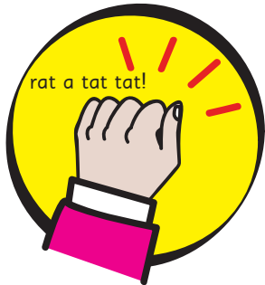
Knock on the door

And he knocked on the door with a rat a tat tat,